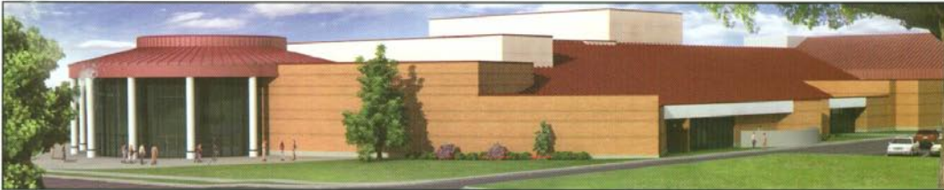
OCCC Performing Arts Theater

The cost to build this theater is $16 million. First, the students stepped up to the plate by passing a resolution, obligating themselves with an increase in student fees that would make $9.2 million in bond funding possible and cover more than half of the estimated cost. A lead gift of $1 million from the Sarkeys Foundation and a $500,000 lead gift from the Inasmuch Foundation sets the stage, so to speak, as we work to raise the balance of the funds. The gift from Sarkeys is the largest gift the College has ever received.