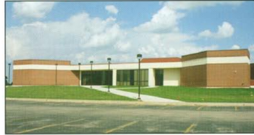
OCCC Health Professions Center

OCCC celebrated the dedication of the Health Professions Center in October. The $7 million construction added 42,879 square feet to the existing complex and includes 14 classrooms and labs, student clinical practice space, a Human Patient Simulator lab, and an Ambulance Simulator where EMS students can practice emergency medicine in the confines of an actual ambulance lab parked inside the building.